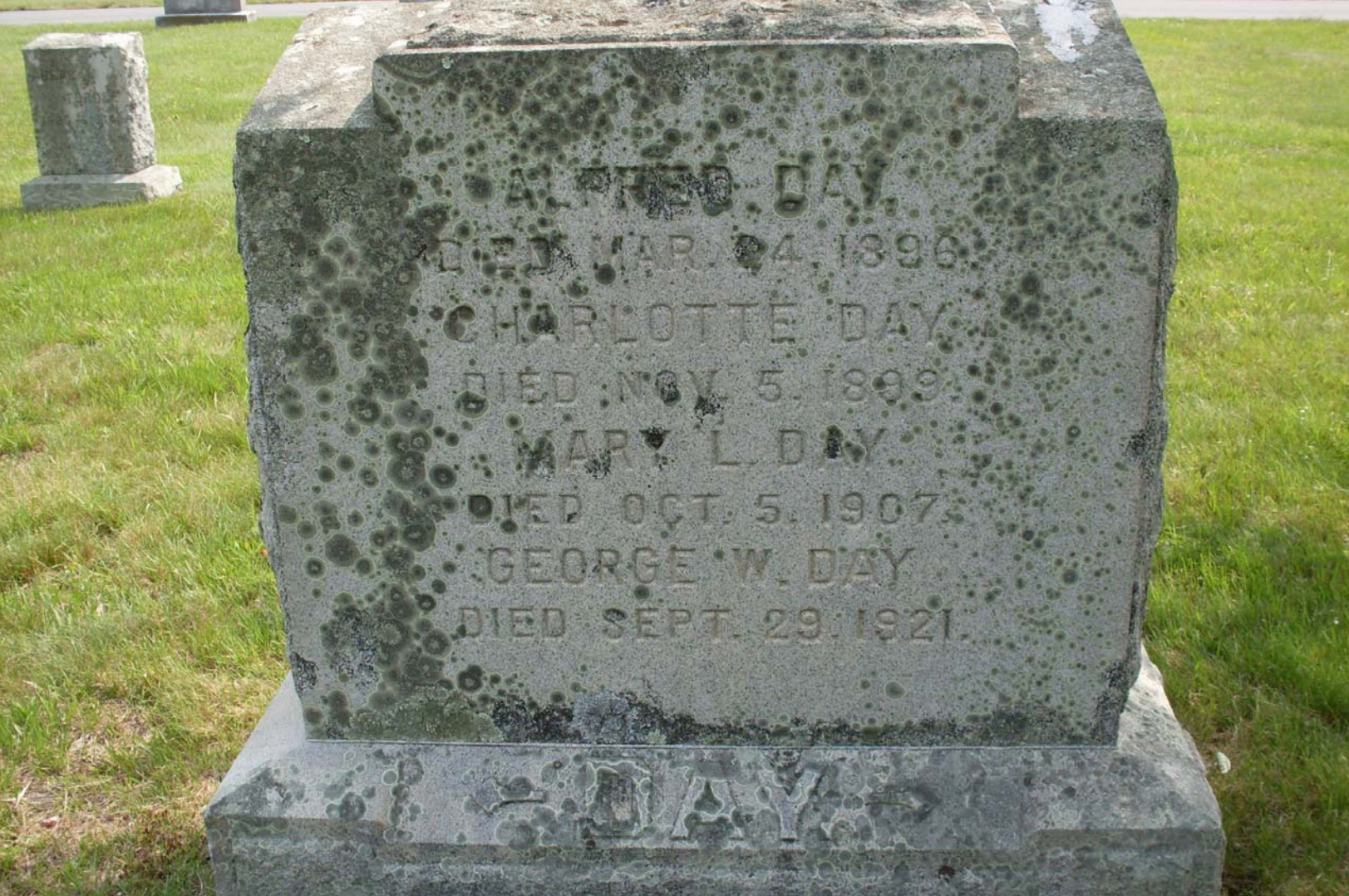
Day Family Grave, South Dartmouth Cemetery, Dartmouth, Massachusetts